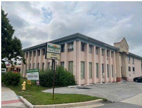
535 DUANE STREET • GLEN ELLYN, IL 60137