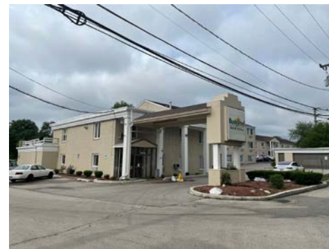
630.469.5000 • WWW.GLENELLYN.ORG